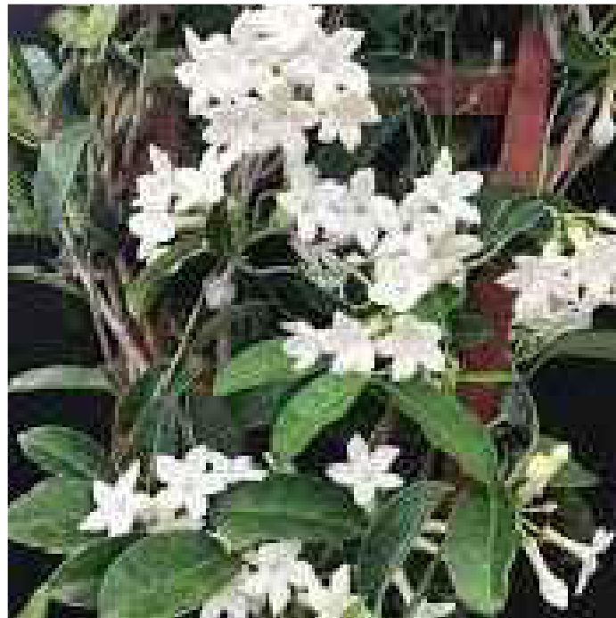
Madagascar Jasmine ( Stephanotis floribunda ) Height: 12-20 ft Spread: 3-6 ft