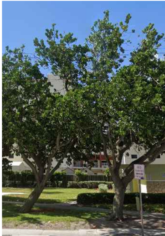
2x Madagascar Olive ( Noronia emarginata ) Height: 25 ft Spread: 30-35 ft