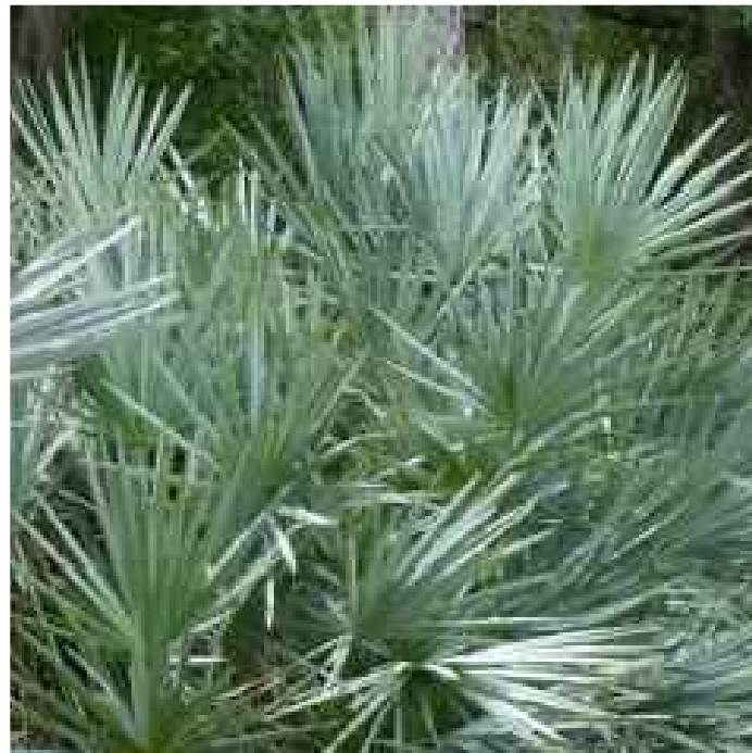
Silver Saw Palmetto ( Serenoa repens ) Height: 3-5 ft Spread: 2-3 ft