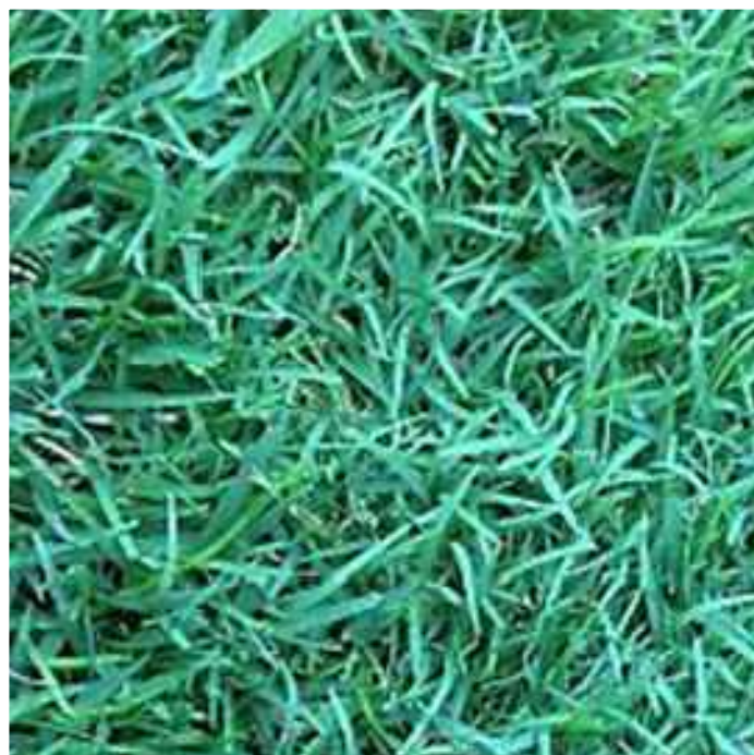
Buffalo grass ( Buchloe dactyloides ) Height: